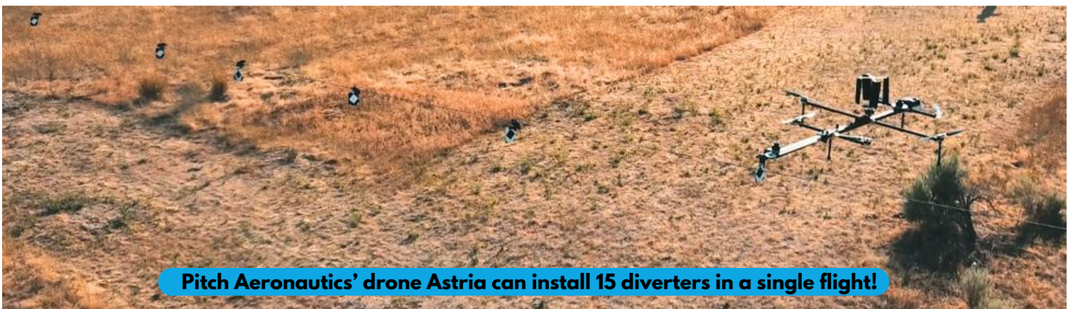
Pitch Aeronautics' drone Astria can install 15 diverters in a single flight!